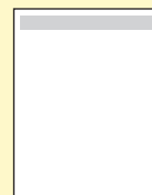
BANNER 800 x 90 pixels