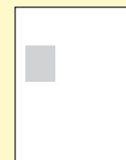
COLUMN 195 x 220 pixels